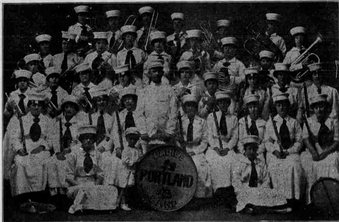
PORTLAND LADIES' BAND—MEMBERS ARTISAN LODGE — EXCELLENT MUSICIANS—24 CONCERTS