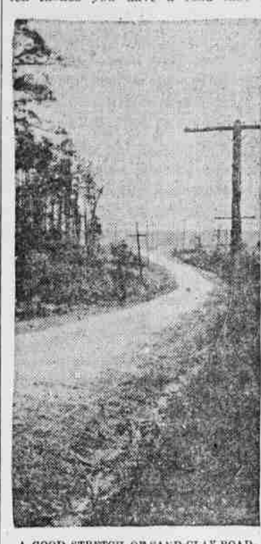
A GOOD STRETCH OF SAND-CLAY ROAD.

road? The first problem is to make a thorough investigation of natural conditions. Sand is the primary and the fundamental thing in the building of a sand-clay road. It is the all of a sand-clay road. The clay merely furnishes or forms a binder. The durability will depend largely upon the texture of the clay. If the clay is open and porous it will sponge up and lose its grip on the sand, and you have a spongy or muddy road, but if you have a water resisting clay and apply sand to the depth of ten inches you have a road that is