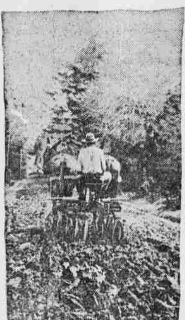
MIXING THE SAND AND CLAY

Now, the sand-clay road or the soil road, which is only a type, has shown a substantial durability as well as a