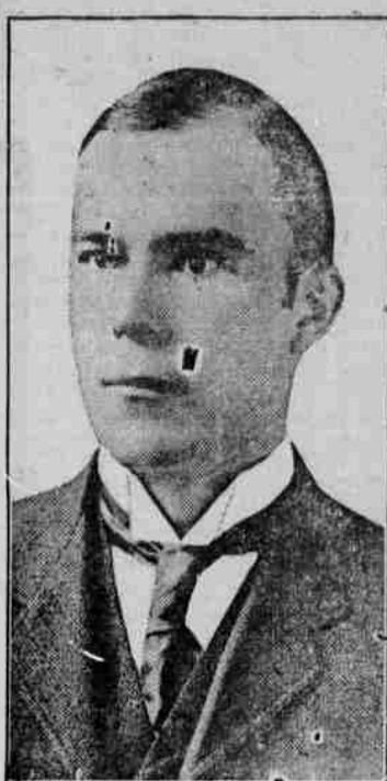
William Morgan Shuster, the American treasurer-general of Persia, whose removal was demanded by Russia.