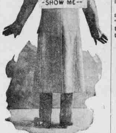
THE LIGHT FELL ON WASH GEORGE HIS STERN PROFILE.

Washing-ton slept in it. I ran over to Hartford to look for the charter oak and ran up against the house where George Washington slept.