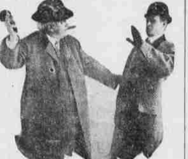
George Washington Slept!