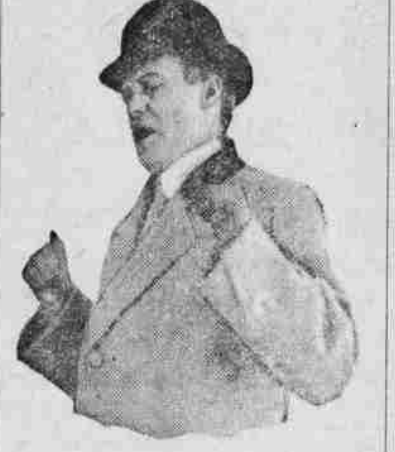
I WAS BEGINNING TO GET A LITTLE FLIPPY MYSELF.

ty, Mo., and 'was still seeing the sights. He invited me to go up into the Harlem neighborhood with him and see some sights, and I went, and