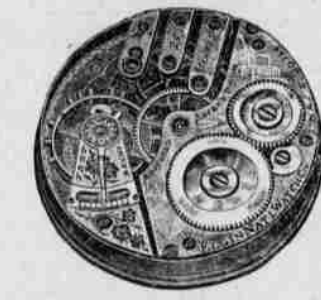
A STOPPED WATCH

is worse than no watch at all. We repair the highest grade watches with the same ease that we would a cheap watch. There is no job that we are afraid to tackle, and when we repair your watch for you we put it in perfect shape.