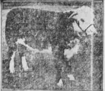
FIG. 18.—A THIRTY STEER.

booked or by pulling heavily on a machine with a great deal of side draft. A sweated animal should be turned out in the pasture until the shoulder is filled up again. Injecting ten drops of turpentine under the skin at intervals not closer than one inch will greatly hasten the process.