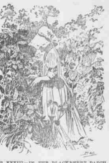
FIG. XXXII.—IN THE BLACKBERRY PATCH.

SMALL fruit can be grown almost as easily as corn or oats if it is gone at in the right way. A liberal quantity grown at home is a luxury that is within the reach of every farmer.