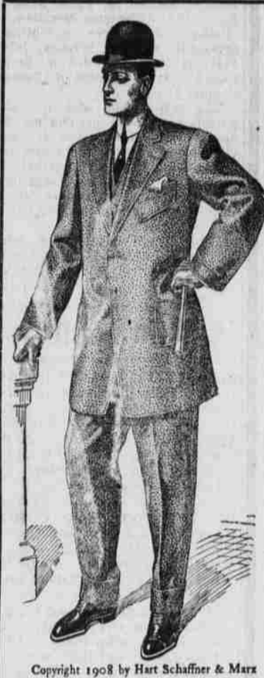
Copyright 1908 by Hart Schaffner & Marx

You'll Find This Store the Right Place for Distinction in Clothes.