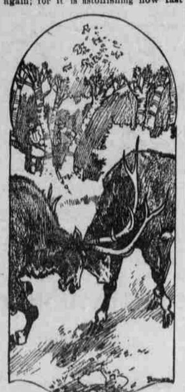
The crash of the meeting antlers resounding through the valley.

We'll show you all Sorts of Good Things to Wear besides Clothes; Shirts, Neckwear, Hats, and all the rest.