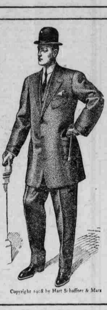
Copyright 1908 by Hart Schaffner & Marx

IF YOU LIKE TO BE DRESSED IN THE SMARTEST STYLE, AND THE BEST QUALITY, NOW'S YOUR CHANCE You'll Find This Store the Right Place for Distinction in Clothes.