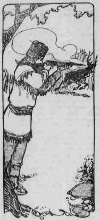
He plunged wildly forward.

I walked stealthily up the valley, until I felt that I was nearly between the two herds; and then stood motionless under a tall pine. I made up my mind, from the sound of the challenging, now very near me, that one bull on my right was advancing towards a rival on my left, who was answering every call. Soon the former approach-