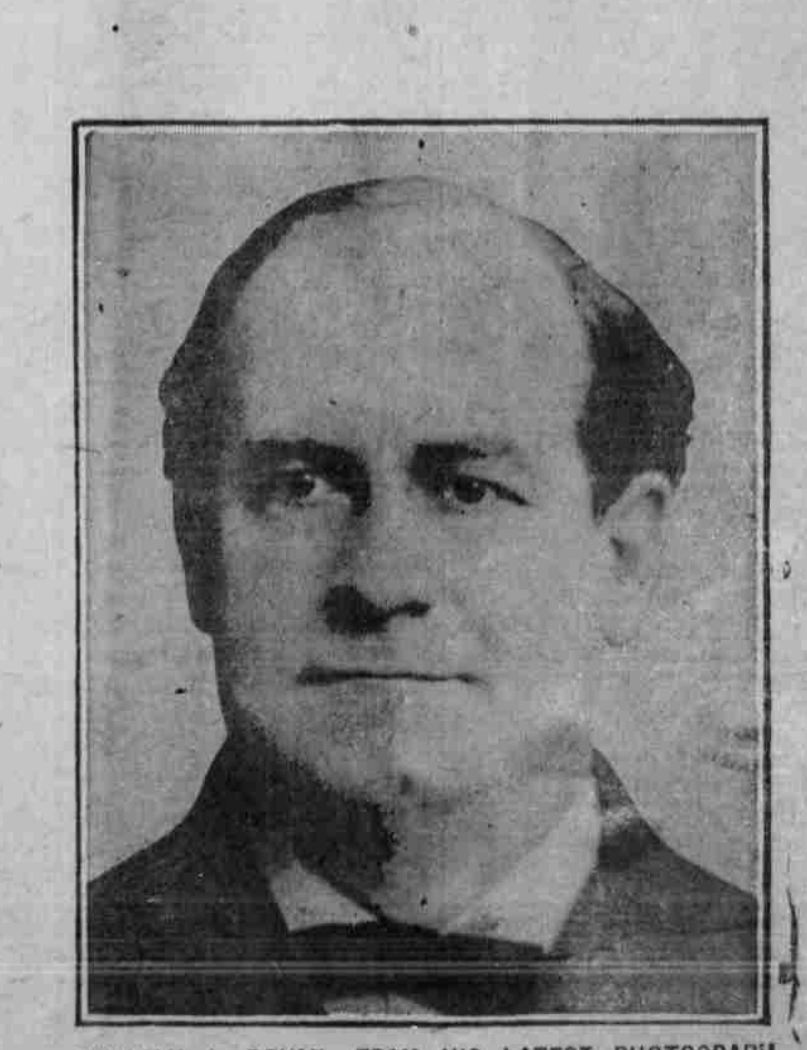
WILLIAM J. BRYAN, FROM HIS LATEST PHOTOGRAPH.