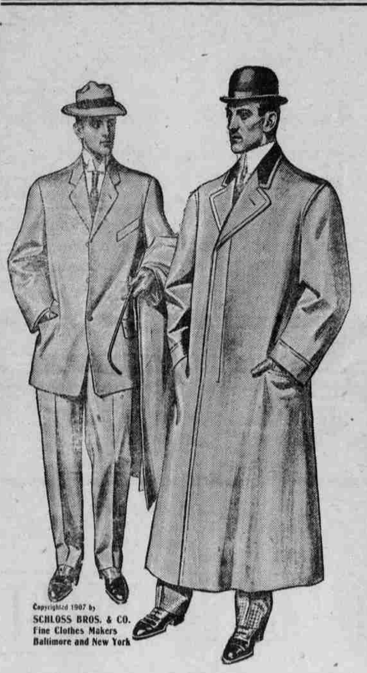
Copyright 1907 by SCHLOSS BROS. & CO. Fine Clothes Makers Baltimore and New York

$20,000 Worth of the highest grade Clothing, Hats, Shoes and Furnishing Goods thrown on the altar of sacrifice at prices that set the purses of the most skeptic in action. The prices tell the story of the great need of cash. The bargains bells of opportunity are ringing loud and clear, and this is your chance to purchase Holiday Goods at a big saving. Read a few of the hundreds of good things in store for you at this fine store.