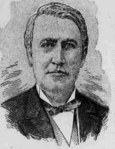
TRADE MARK Thomas A. Edison

HERE IS YOUR OPPORTUNITY If you are a reliable, responsible person living anywhere in the United States this great special offer on our new style special 1908 Edison Phonograph Outfit No. 5 will be interesting to you and may mean much to your family.