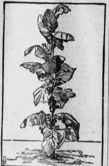
TYPICAL PLANT—UNCLE SAM SUMATRA LEAF TOBACCO.

The cured leaves will average about sixteen inches in width by twenty inches in length, although the size varies according to field and cultural conditions. The yield of the crops of this variety is high, being as much as 1,600 pounds