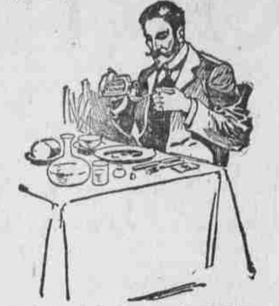
'Tis a joy to eat—I welcome my dinner hour; Because I rout indigestion with August Flower!

Constipation is the result of indigestion, biliousness, flatulency, loss of appetite, self-poisoning, anemia, emaciation, uric acid, neuralgia in various parts of the system, catarrhal inflammation of the intestinal canal and numerous other ailments that rob life of its pleasures if they do not finally rob you of life itself.