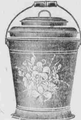
For the Bedroom $1.50