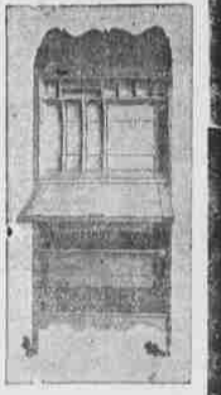
Writing Desk $5.50

Your friends will stay with you during the Fair, and you ought to have an "iron bed" to accommodate them. One of our serviceable iron beds only $1.95