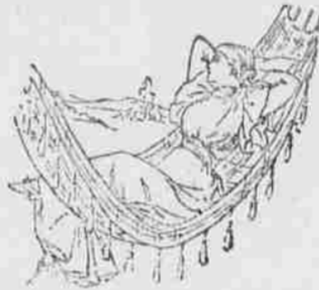
Hammocks. Good one for $2.50

Your friends will stay with you during the Fair, and you ought to have an "iron bed" to accommodate them. One of our serviceable iron beds only $1.95