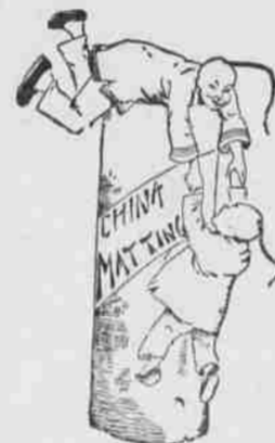
Summer Floor Cover Per yard 15c