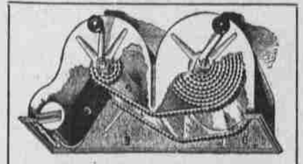
Developing Machine $2.00 to $5.00

We have a full line of Kodaks and Cameras to select from and an up-to-date stock of Photo Supplies for finishing purposes. Every step in photography is simple now. No dark room at any stage of the work and better results than ever.