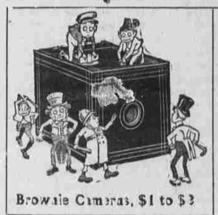
Brownie Cameras, $1 to $3