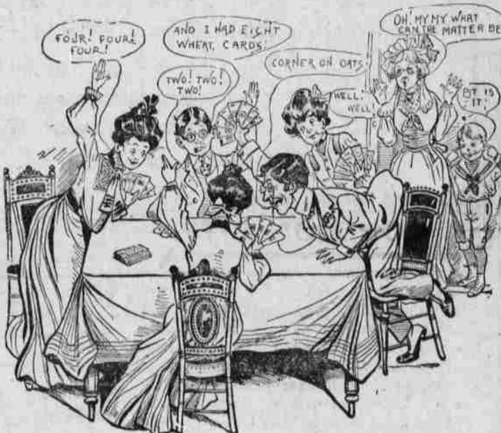
Flinch, Pit, Panic, Stock Exchange, All the rage now—35 and 50c.