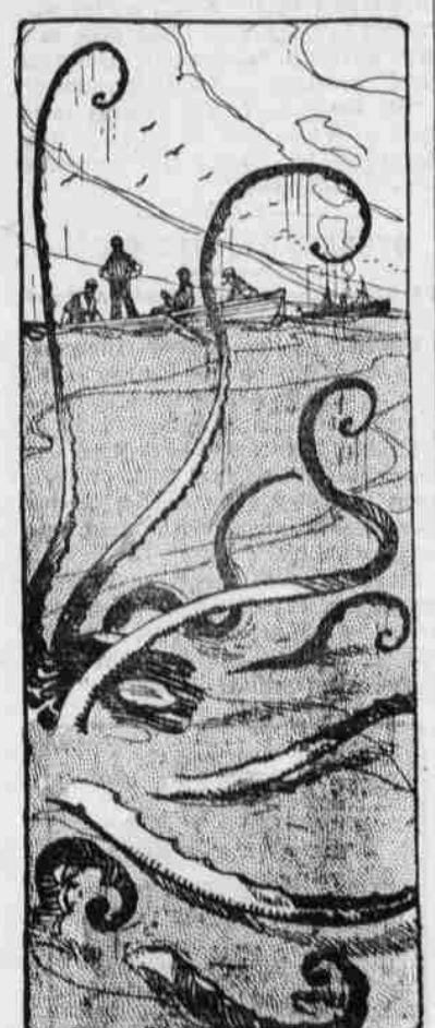
THE SNAKY TENTACLES THRASHED AIM-

The pulp was not fast enough, for its beautiful, slender enemy, some four feet long, we guessed, hurled itself upon it like a lance, though eight long. snaky arms wound around and enveloped it. I knew that if their rows of thorn armed suckers once closed on human flesh nothing short of tearing them apart piecemeal would extricate their victim, but presumably the eel's skin afforded a poorer hold, for during a few seconds one could see the morena tearing at the flaccid sack of body. Then as it backed clear with something in its jaws the water grew foul with stirred up sand or the tint some