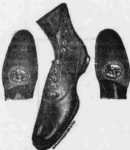
Boots and Shoes

Women's Round and Tab Collarettes Storm Collars, etc