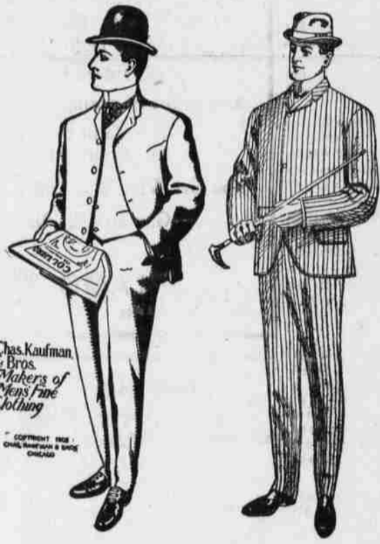
Chas. Kaufman & Bros. Makers of Men's Fine Clothing

Boys, Wool and Fur Hats, 50c, 75c, $1 Men's Wool Hats, 50c, 75c, $1 Men's Fur Hats $1.50, 2, 2.50, 3