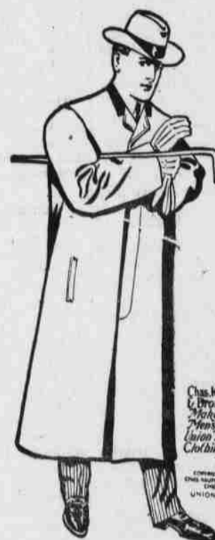
Chas. Kaufman & Bros. Makers of Men's Fine Union Made Clothing

Excellence in every hat sold under the name of Gordon, price $3