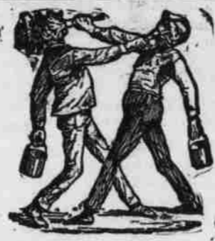
THE SHERWIN-WILLIAMS PAINTS