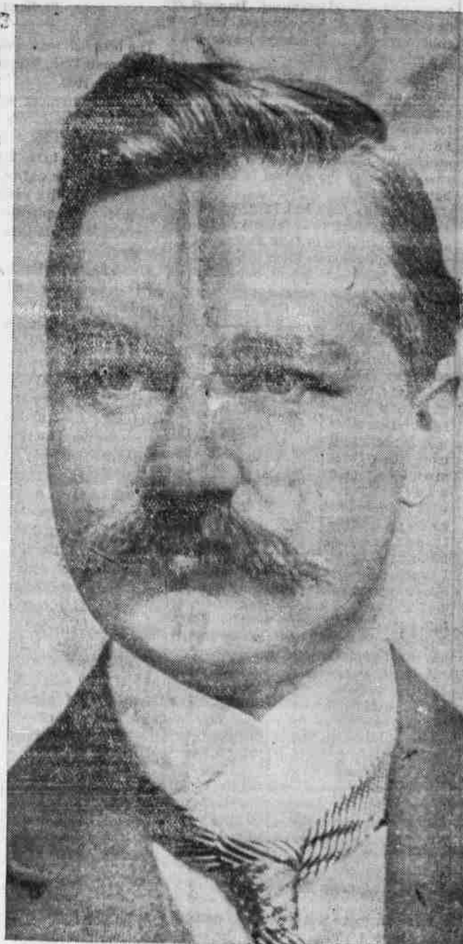
HONORABLE A. E. REAMS Democratic Nominee for Congress, First District.