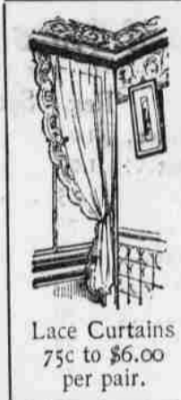
Lace Curtains 75c to $6.00 per pair.