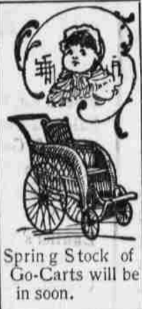
Spring Stock of Go-Carts will be in soon.