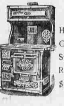
High Grade Steel Range $35.00