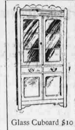
Glass Cupboard $10