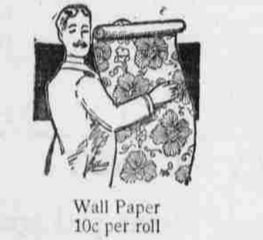
Wall Paper 10c per roll