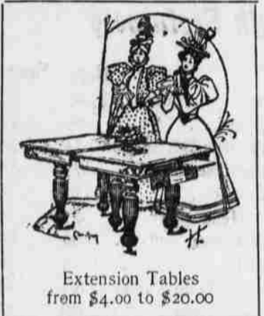
Extension Tables from $4.00 to $20.00

The only way to get what you have to give is to see that you understand fully our desire to treat you well. Our offerings are planned with a view to giving the best returns for your money, so that you may feel an interest in coming again.