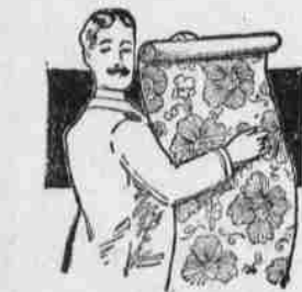
Wall Paper 10c per roll