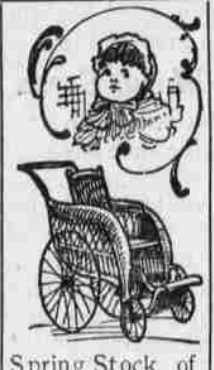
Spring Stock of Go-Carts will be in soon.