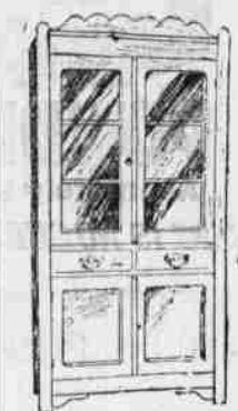
Glass Cupboard $10