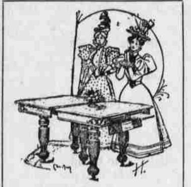
Extension Tables from $4.00 to $20.00

The only way to get what you have to give is to see that you understand fully our desire to treat you well. Our offerings are planned with a view to giving the best returns for your money, so that you may feel an interest in coming again.