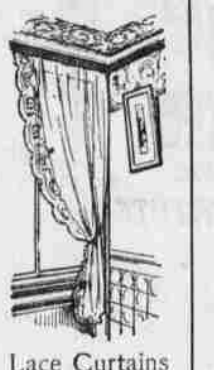
Lace Curtains 75c to $6.00 per pair.