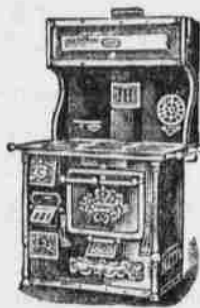
High Grade Steel Range $35.00