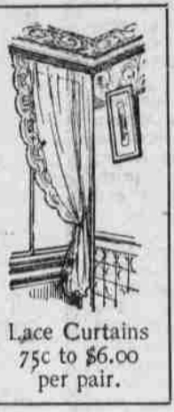
Lace Curtains 75c to $6.00 per pair.