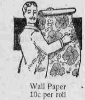
Wall Paper 10c per roll