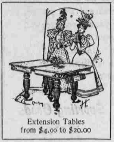
Extension Tables from $4.00 to $20.00

The only way to get what you have to give is to see that you understand fully our desire to treat you well. Our offerings are planned with a view to giving the best returns for your money, so that you may feel an interest in coming again.