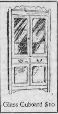
Glass Cupboard $10