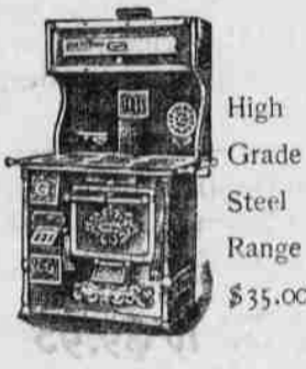
High Grade Steel Range $35.00