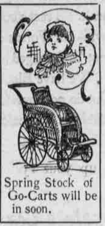
Spring Stock of Go-Carts will be in soon.