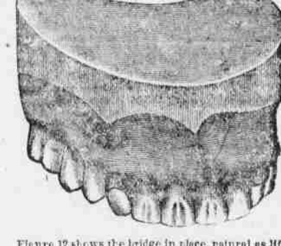
Figure 17 shows the bridge in place, natural as life

Figure 9 shows a root with crown ready to stach. It is folly to extract a root when it can be crowned and made as useful as ever.