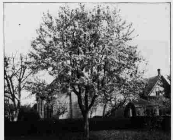
Cherry tree in full bloom.