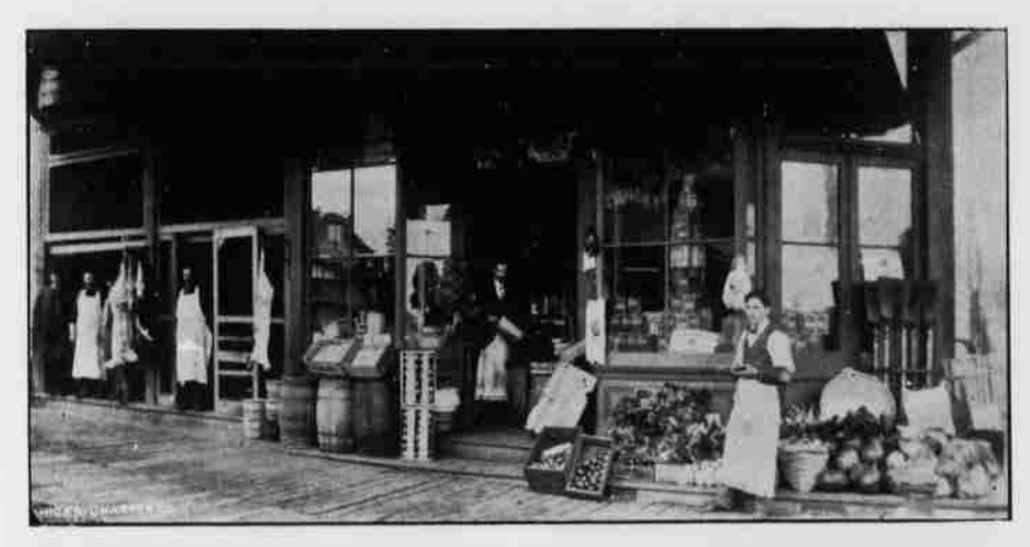
BROWN & WELSH