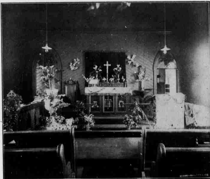
INTERIOR OF ST. PAUL'S EPISCOPAL CHURCH