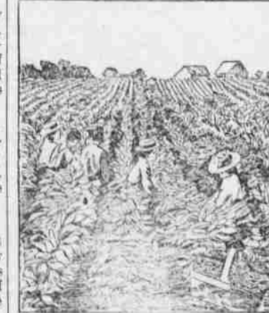
PICKING SNAP BEANS.

Celery is trimmed, counted and tied, a dozen plants in a bunch, these bunch-