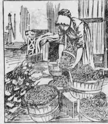
PREPARING SNAP BEANS FOR MARKET.

Time was when grocers and marketmen piled beets, onions, turnips and all vegetables into a lot of old boxes and barrels that set in front of their doors, in a haphazard way. Now every up to date tradesman in these lines so arranges his vegetables either in his shop windows or in front of his