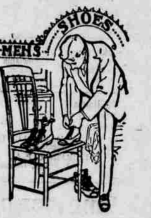
Table Cloth. White and colored, best quality, per yd. 18c. Shoes.

Hats and Caps. Men's caps. 20, 25 and 50c. Men's Fedora hats. 45c, 75c, $1 and up. Boys' Fedora hats. .50c. Men's dress straw hats. 25c to $1.00. Boys' dress straw hats. 20c, 25c, 50c.