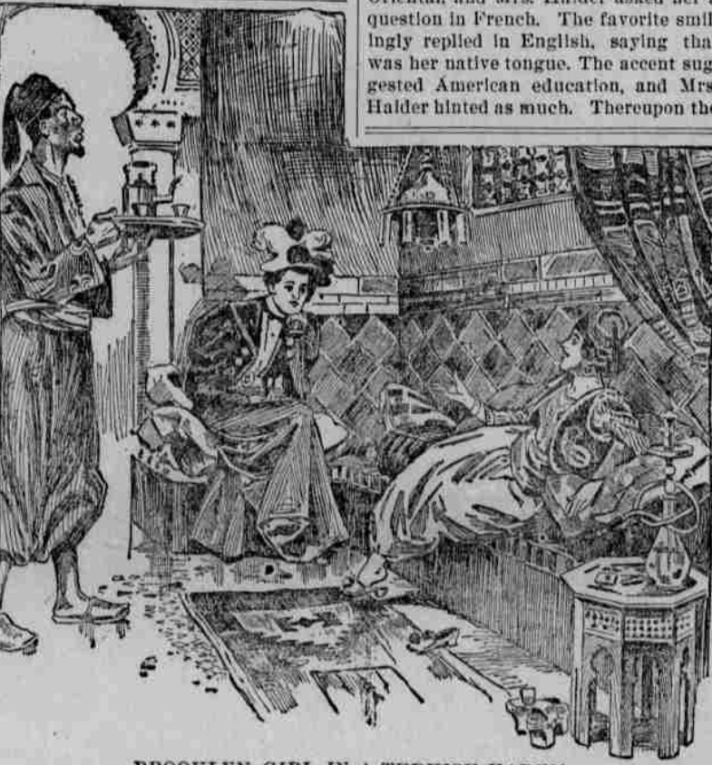
BROOKLYN GIRL IN A TURKISH HAREM.

New York, longitude 76 degrees west, time 4:15 a. m. Chicago, longitude 88 degrees west, time 3:15 a. m.