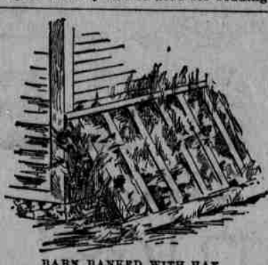
BARN BUNKED WITH HAY.

Hundreds of farm buildings that contain shivering and unthrifty stock all through the winter months could, at almost no expense whatever, be made very warm and comfortable.