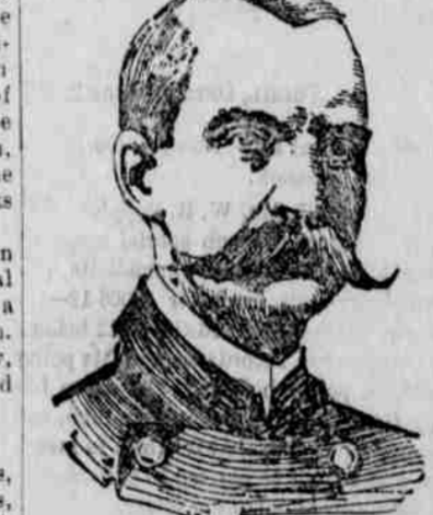
GEN. JOHN J. COPPINGER.

Tampa, Fla., Aug. 3.—The transport Michigan sailed yesterday from Port Tampa and crossed the bar of the bay today. She was loaded with fresh meat for General Shafter's army, be-