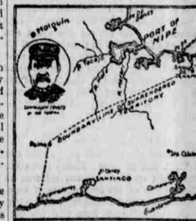
Map showing location of the important port won by the expedition under Commander Cowles.

London, July 30.—According to a dispatch from Berlin, a newspaper there professes to know that the Porto Rican