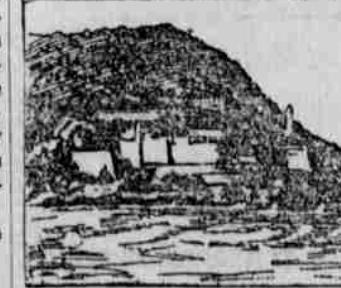
FORTIFICATIONS AT SANTIAGO.

Washington, July 20.—A state paper that will be historic, marking an epoch in American history, was issued tonight by direction of President McKinley. It provides in general terms for the government of the province of Santiago de Cuba, and is the first document of the kind ever prepared by a president of the United States. By order of Secretary Alger, Adjutant-General Corbin tonight sent the document to General Shafter, in command of the military forces at Santiago. The paper is not only an authorization and instruction to General Shafter for the government of the captured territory, but also a proclamation to the people of the territory of the intentions of the government of the United States regarding them and their interests. It marks the formal establishment of a new political power in the island of Cuba, and insures to the people of the territory over which the power extends absolute security in the exercise of their private rights and relations, as well as security to their persons and property.