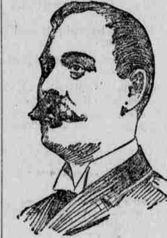
GENERAL JOSE TORAL.

Washington, July 20.—It has been finally decided that none of the troops that participated in the actual fighting before Santiago shall be employed on the Porto Rico expedition. There are several reasons for this: First, the men have suffered severely from hard-