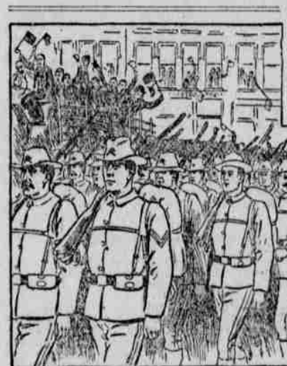
SECOND MARCH OF 6TH MASSACHUSETTS THROUGH BALTIMORE.