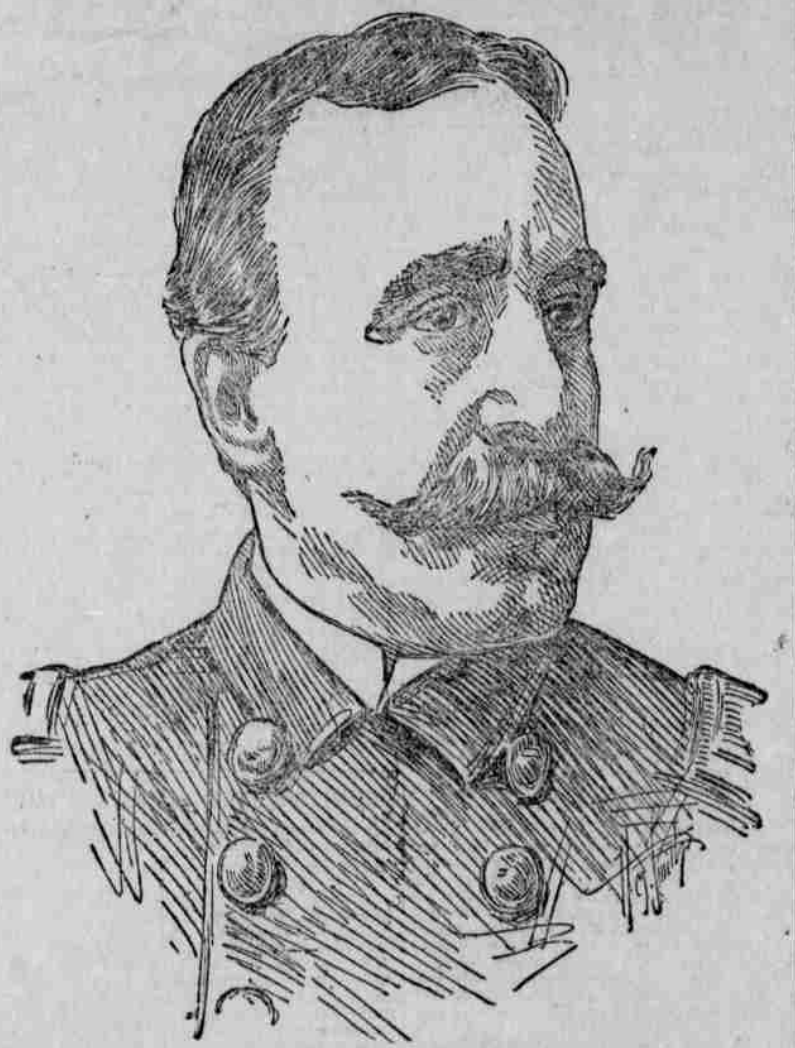
ACTING ADMIRAL DEWEY.