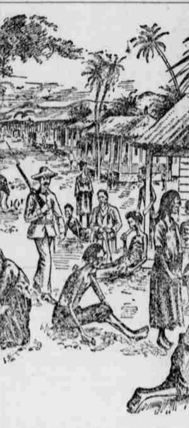
WATCHING HER DYING BABE.

Before this Weyler had already shown his sanguinary spirit and plans of murder. Prisoners of war and innocent persons unjustly charged with aiding the rebellion were shot every day in Havana,