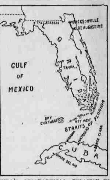
CUBA'S GEOGRAPHICAL RELATION TO THE UNITED STATES.

Valeriano Weyler y Nicolau to succeed Martinez Campos. The question may be asked why the patriots, after so many victories, did not invest the city of Havana and end there with the Spanish dominion. The answer is very clear. After the battle of Coliseo Gen. Gomez reviewed his troops and found that each soldier had only three cartridges. The Cubans in the United States were making vain efforts to send a big expedition to the patriots. But if the Spanish army was defeated in the fields of Cuba, Spanish diplomacy was triumphant at Washington. At Guira de Melena on Jan. 4, 1896, the patriots had to fight with their machetes to enter the province of Havana. For such a state of affairs Gen. Gomez considered his best plan to be to organize armies in all the provinces invaded, so far as his resources permitted him to do, and try to raise the war in Pinar