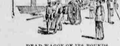
DEAD WAGON ON ITS ROUNDS.

The revolution was saved. The few patriots who took up arms on Feb. 24 at Baire and Manzanillo had courageously resisted under Gen. Bartolome Maso, now Cuba's president, the attacks of the columns of the Spanish Gen. Lachambre, as