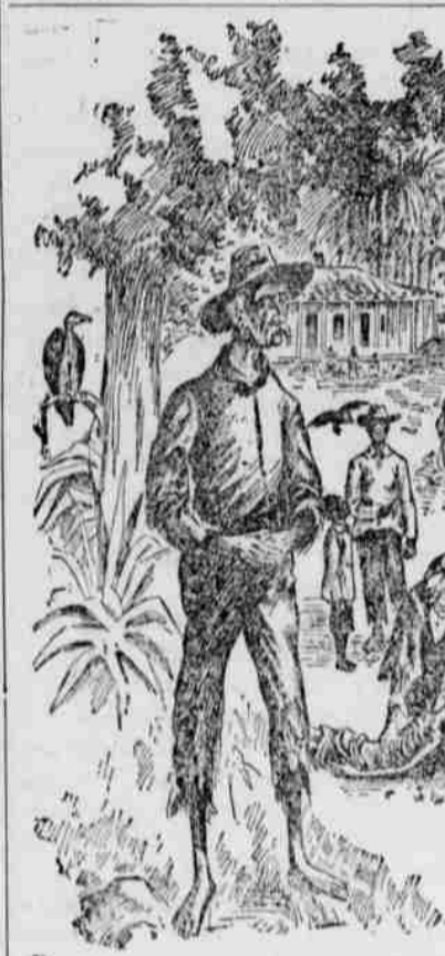
A SCENE AMONG THE STARVING RECONCENTRADOS.

From April to October Gomez successfully carried the war through Puerto Principe province and laid his plans for the invasion of the west. On Oct. 22 Maceo, having received orders from Gomez, who was appointed commander-in-chief of the army, in September, by the assembly