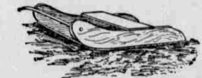
SUBSTITUTE FOR ROLLER.

An easily made substitute for a roller is shown herewith. It is from the Farm Journal. The sides are cut from two planks, and narrow strips are then nailed to the lower edges. This contrivance can be weighted to any degree desired and will do good service in fluffing or firming the soil. A roller is one of the most valuable implements that a farmer can use in making a fine