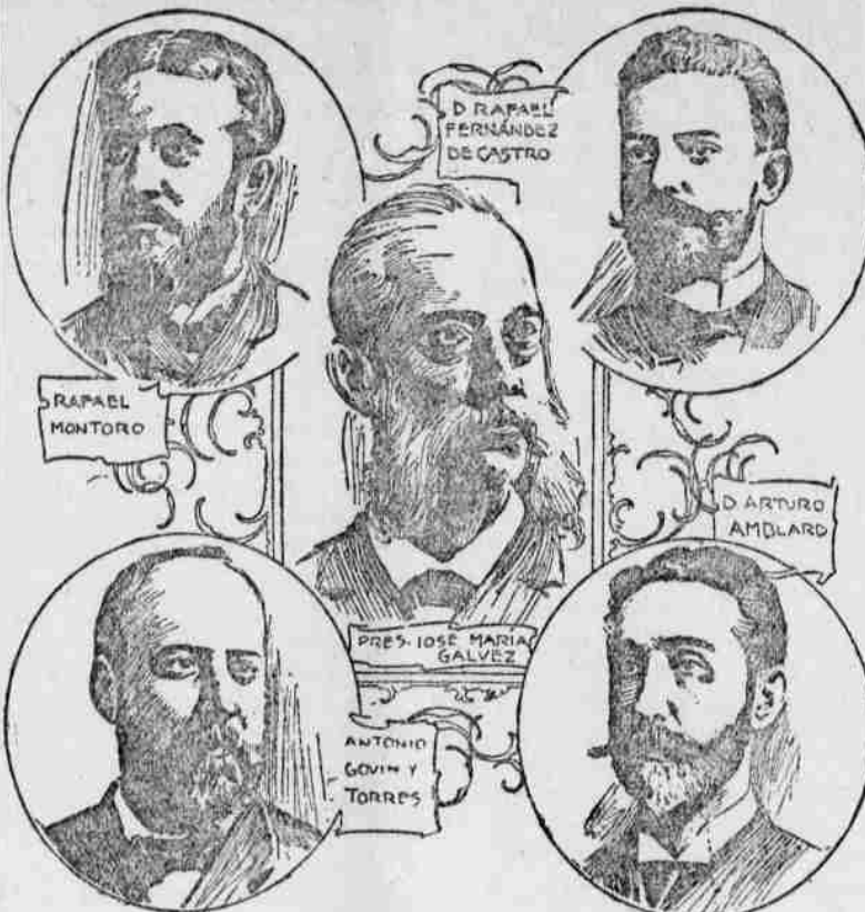
These are the men who have been selected to dignify portfolios in the cabinet of Cuba, and their appointments have been announced by Capt. Gen. Blanco.