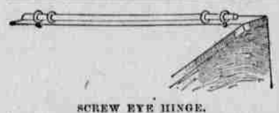
SCREW EYE HINGE.

Homemade Hinges. One frequently needs a great number of small hinges in making chicken and other coops. The two sketches given herewith show homemade hinges that are better than leather and cheaper than the hardware dealer's steel butts. The one shown first is made of screw eyes, inserted with a round rod of wood