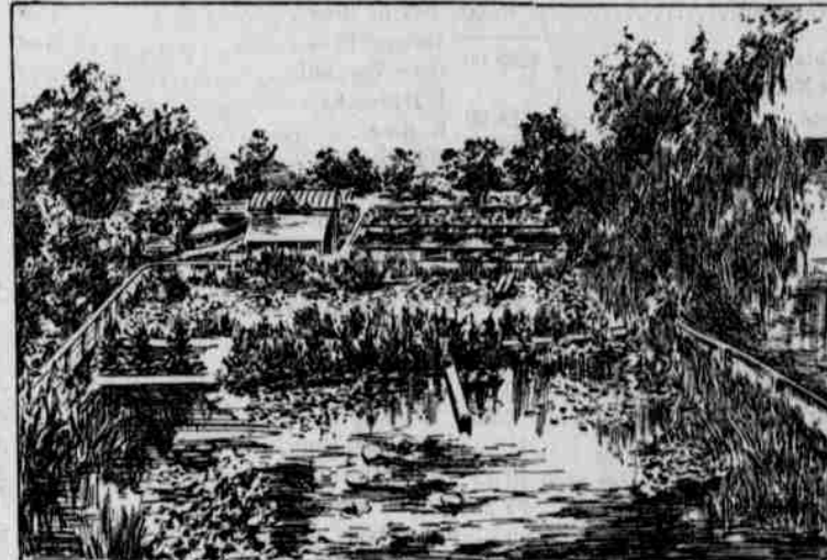
THE PONDS FOR FISH CULTURE AT WASHINGTON.