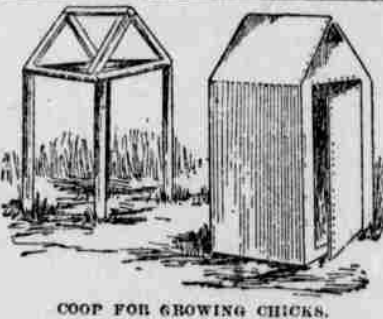
COOP FOR GROWING CHICKS.

A Fall Chicken Coop. In the fall the small coops scattered about get too small for the growing chicks. It is not convenient to put them into the permanent quarters with the older fowls, nor is it wise to allow them to shift for themselves out of doors, roosting on fences and in apple trees. A simple plan to meet the fall requirements of chickens is shown in the accompanying cut, from the Orange Judd Farmer. Four stakes are driven into the ground, and a bit of roof frame nailed to the top. Over this is stretched and tacked the cheapest kind of cotton cloth, a door and ventilating openings being arranged as shown in the sketch. Perches can be nailed from corner post to corner post, diagonally, and the growing chicks, kept there till the weather becomes cool enough to make winter quarters necessary. The cloth