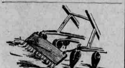
FOLLOWER FOR THE CULTIVATOR