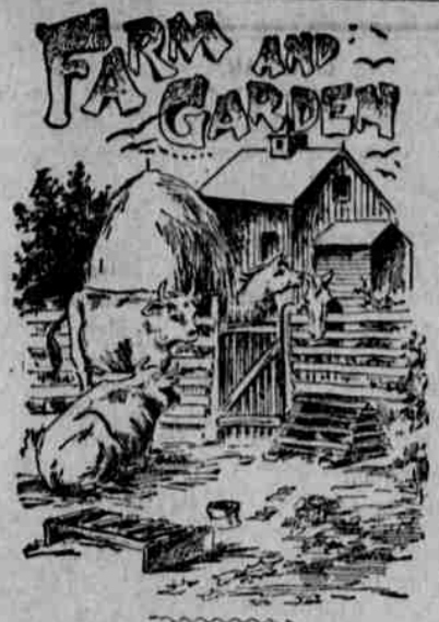
FARM AND GARDEN