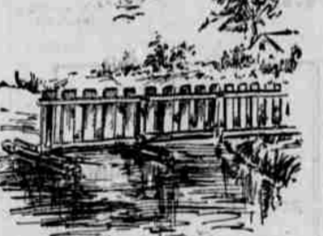
SECURE FLOATING FENCE.

An excellent water fence is shown herewith. Some short cross logs support one, two or more lengths of stout rails that form the bottom of the fence. Holes are bored in these, in which up-