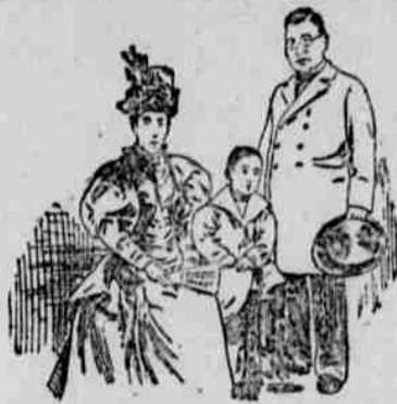
JAPANESE MINISTER AND FAMILY.