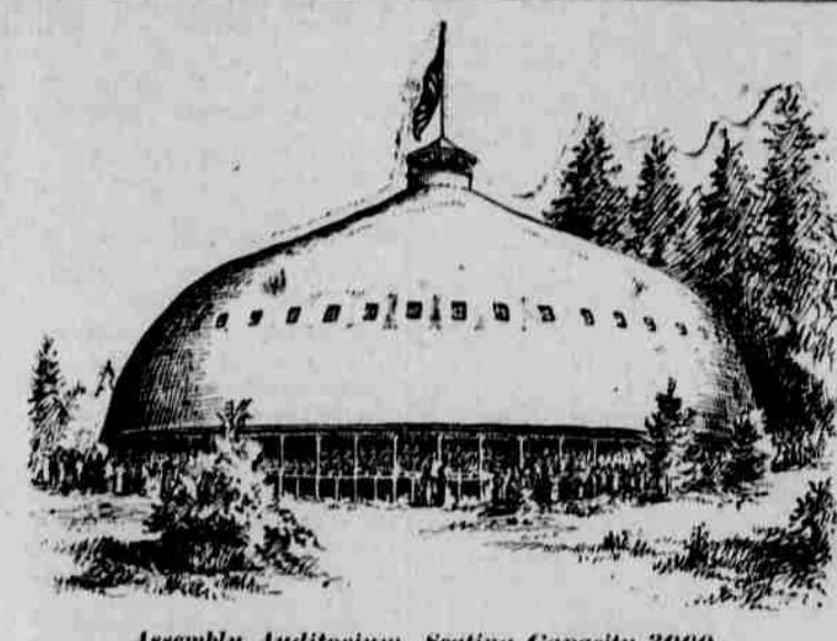
Assembly Auditorium, Seating Capacity 3000.

FOR DYSPEPSIA and Liver Complaint you have a printed guarantee on every bottle of Shiloh's Vitalizer never fails to cure. For sale G. A. Harding.