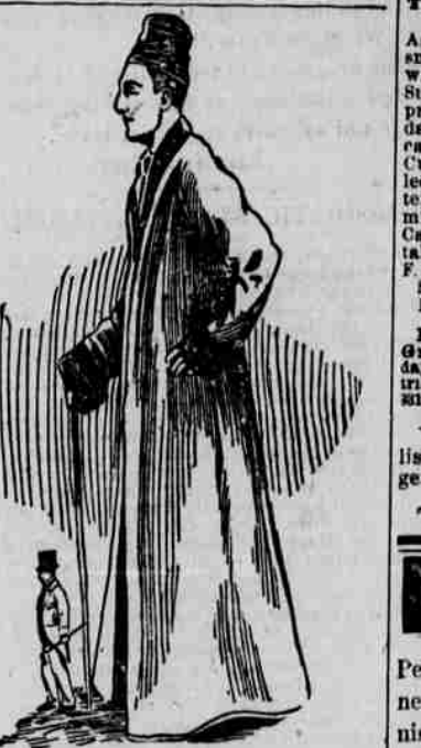
THE LONG AND SHORT OF IT.