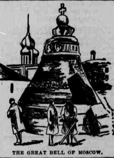
THE GREAT BELL OF MOSCOW.

"Like the morning stars when they sang together is the melodious thunder of the bell in Kremlin Tower, and sweet as the harp of David are the bells of Valdia," is a Russian saying.