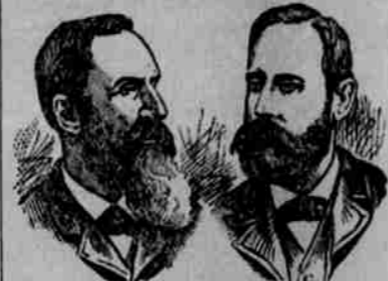
JOHN HERRESHOFF. NAT HERRESHOFF.