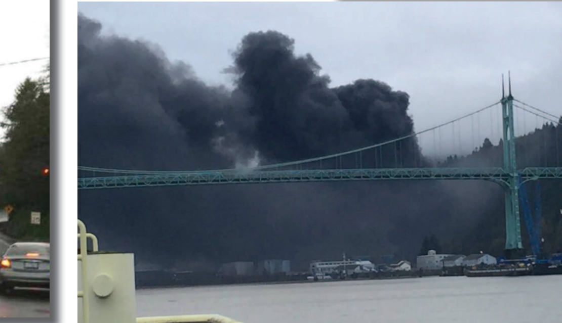
Left: Smoke engulfs the St. Johns Bridge. Police immediately closed the bridge.