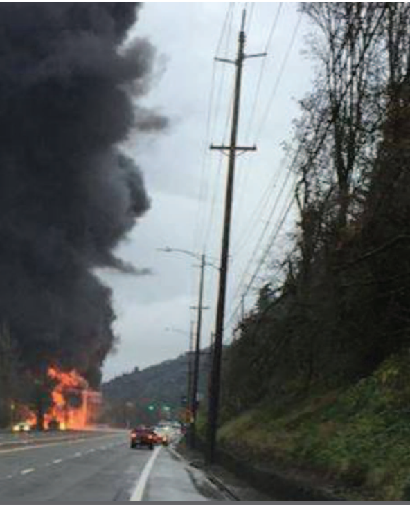
A driver on Hwy 30 captured this shot right after the alarming accident.