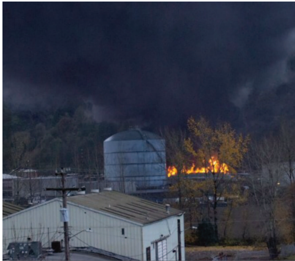
Above: From St. Johns the flames could easily be seen.