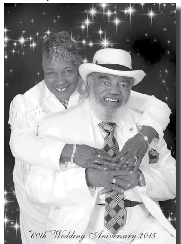
"60th" Wedding Anniversary 2015

We will be celebrating with them October 15 – 19, 2015 at Portland Miracle Revival Church, 8333 N. Ivanhoe St., Portland, OR., 97203.